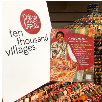
Poster at Ten Thousand Villages: Fair trade relationships

Photo of books: Display of childrens' books