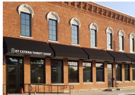
Exterior of Et Cetera Thrift Shop.