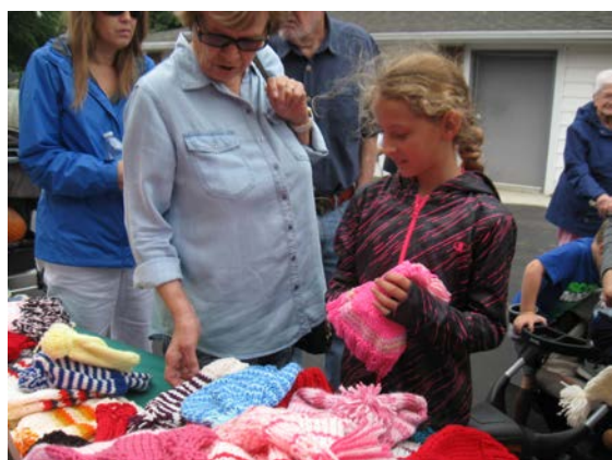
Looking for the perfect hat among all Min's handiwork!