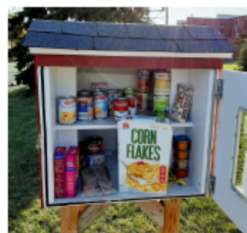
BPC Little Free Pantry