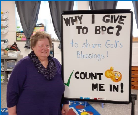
To share God's Blessings!