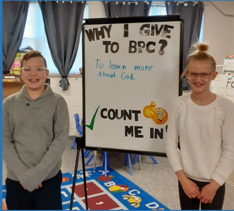
To learn more about God.