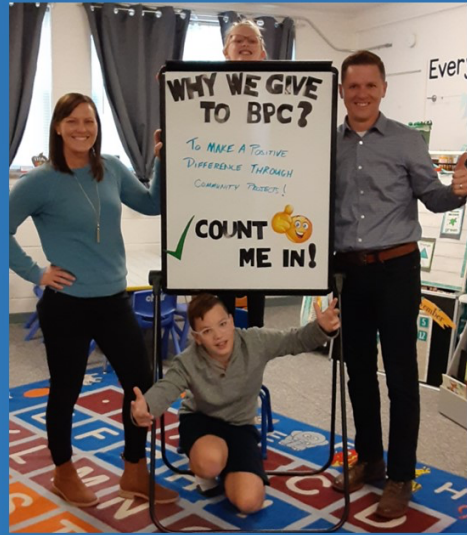
To make a positive difference through community projects!